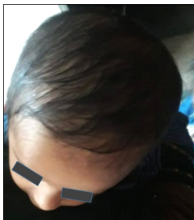
Figure 1: Showing macrocephaly

Anterior fontanel was open 1 × 1 cm and full. Examination findings were consistent with upper motor neuron lesion. Rest of the examination was unremarkable.