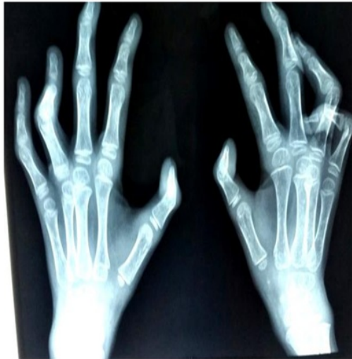
Fig.1: X-ray hands showing B/L camptodactyly