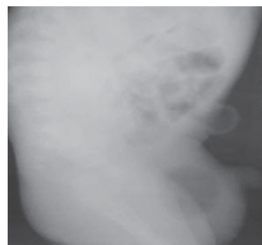
Figure 3: Plain X- ray showing gas shadow scrotum

Fever and leukocytosis may be present depending on presence of inflamed appendix or perforation with gangrene. 3 However, ultrasound and CT scan may be helpful in diagnosis. 4,5 CT scan may help in detecting situs inversus or other co-existing anomalies. Color doppler may be a useful modality in cases suspected of gangrene or inflammation with no or increased vascularity. 6 Plain X-ray abdomen showing gas shadow in scrotum also done presuming hernia in a case report. 7